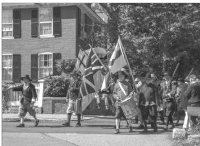
Left: Flag Bearers at the Mayflower Pilgrim Progress, a reenactment of the procession to church for the 51 surviving Pilgrims of the first winter, 1621.